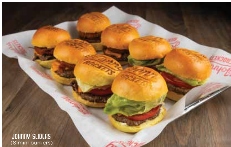
JOHNNY SLIDERS (8 mini burgers)