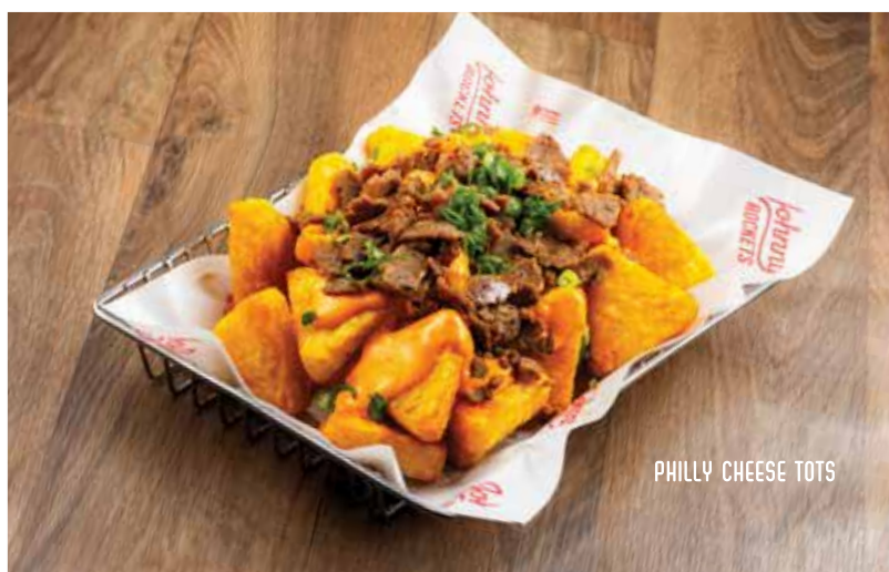
PHILLY CHEESE TOTS